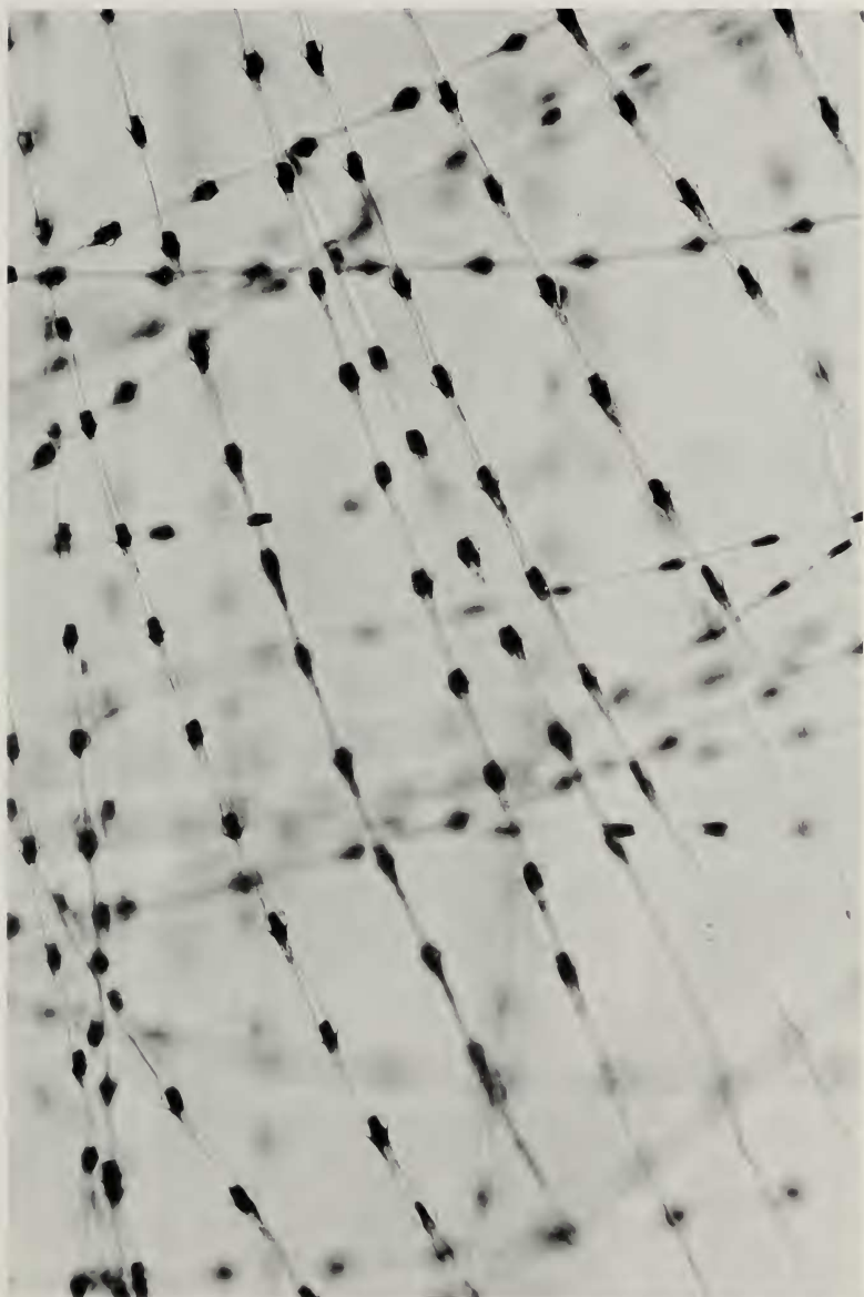
FIG. 3. Photomicrograph (250 \times ) of downy barbules of Antillean Piculet.